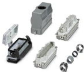
Connector set, consisting of: B24 sleeve housing and panel mounting base, 24-pos. plug and socket insert, M32 cable gland

Please be informed that the data shown in this PDF Document is generated from our Online Catalog. Please find the complete data in the user's documentation. Our General Terms of Use for Downloads are valid ( http://phoenixcontact.com/download )