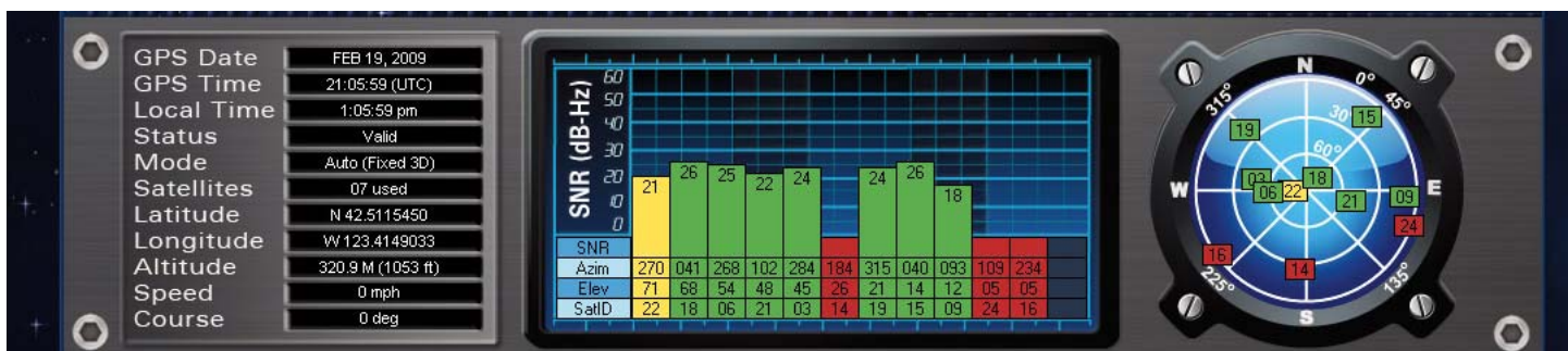
Figure 3: Connected Screen (Display Section)

On the far left is a polar plot showing the location of the satellites in view relative to the receiver's position. The satellite's ID number is shown and is color coded as described above.