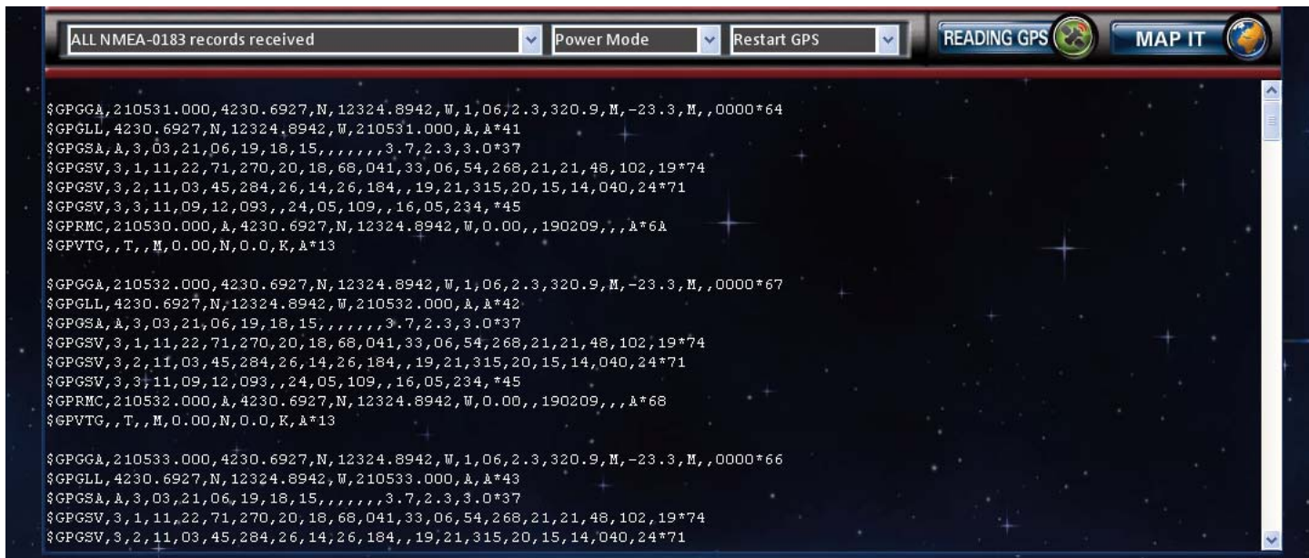
Figure 4: The Connected Screen (Data Section)

The bottom half of the screen is a list of the data from the receiver. The format of this data is controlled by the dropdown menu above the box.