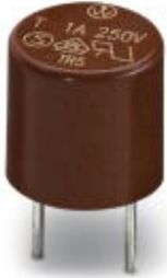
Replacement fuse, for INTERBUS-ST modules

Please be informed that the data shown in this PDF Document is generated from our Online Catalog. Please find the complete data in the user's documentation. Our General Terms of Use for Downloads are valid ( http://phoenixcontact.com/download )