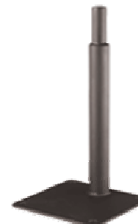
Model: 960-09 Mount Stand, 9" (203.2mm)

Click on any of the above images to find out more about the products pictured.