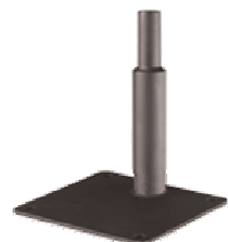
Model: 960-06 Mount Stand, 6" (127mm)