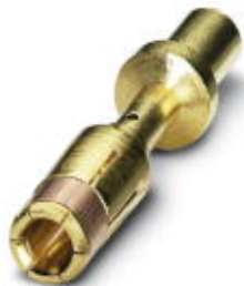
Crimp contact, turned, Single contact, contact diameter: 3.6 mm, crimp range: 4 mm 2 ... 6 mm 2

Please be informed that the data shown in this PDF Document is generated from our Online Catalog. Please find the complete data in the user's documentation. Our General Terms of Use for Downloads are valid ( http://phoenixcontact.com/download )